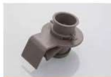
Airway Valve (25627)