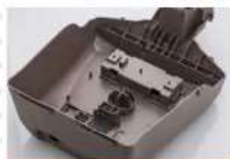
Body Frame (25624)