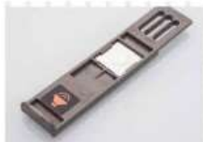
CPR Clicker Unit (25629)