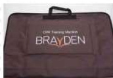
Carry Case & Training Mat Carries 1: (25632) Carries 4: (25635)