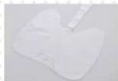
Lung Bag (25628)