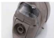
Head Unit (25622)