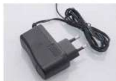
Optional AC Adapter (25636)