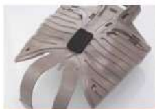
Rib Frame (25625)