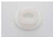
Mouth Connector (25626)