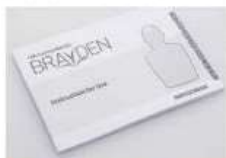
Instruction Manual (25633)