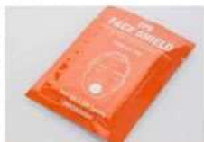
Face Shields (25634)