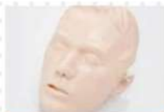
Face Piece (25620)