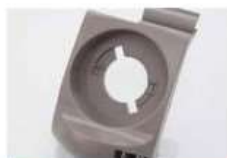
Chin Piece (25623)