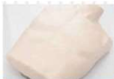
Body Skin (25621)