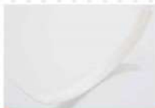
CPR Clicker Actuator (25630)