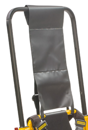
Vinyl head support